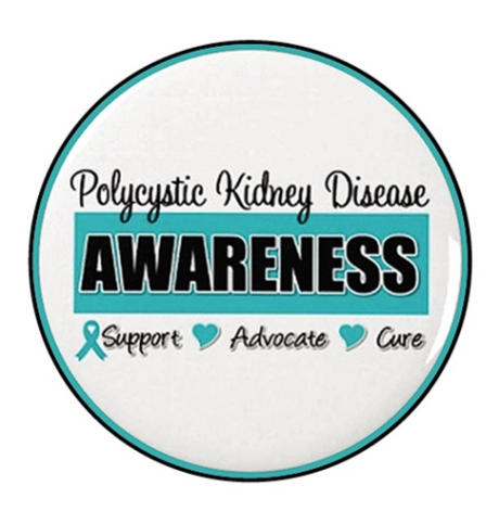
Figure 1: Pin-back button for PKD Foundation